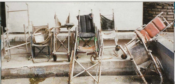
Sharing Resources Worldwide - Before and after pictures of restored wheelchairs.