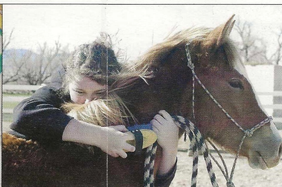
Medicine Horse Program

Graphic Sportswear Union Bank Wells Fargo Bank Pearl Wonderful Clothing Heffernan Insurance Group DSB, Inc. Bridgewater Associates Larry Cragg & Associates West Valley Realty San Francisco Foundation Rosebud Agency Creative Arts Agency Lucas Arts & Entertainment London & Co, LLP Mesa Boogie Thull Fine Arts Design, LLC Piper Jaffray & Company as well as many generous individuals. We are grateful to all Milagro's sponsors!