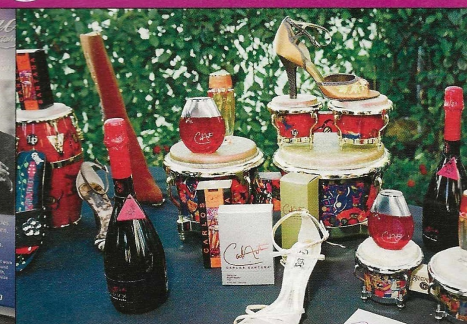
Santana licensing products on display.

Our first Milagro Foundation Benefit by the Santana Band helped us make a difference in the lives of children around the world through the generous support of our many sponsors.